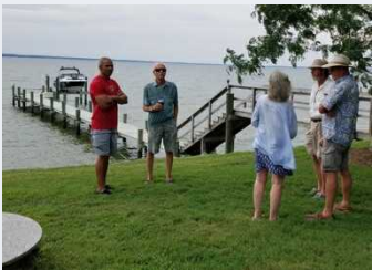
Enjoying good conversation and the breeze by the water.