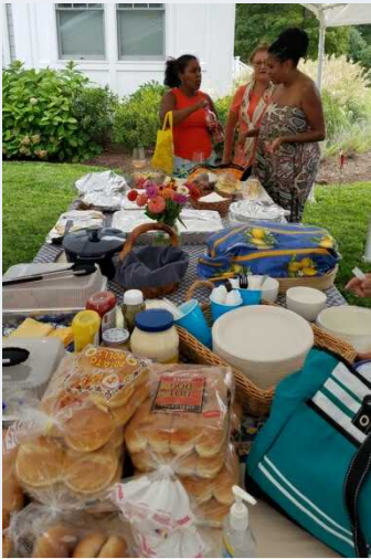
Setting up for the picnic!