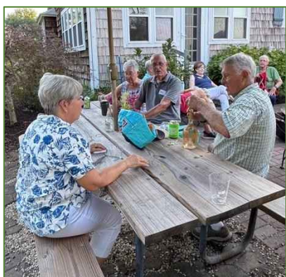
Our new president explaining his upcoming role to the First Person?