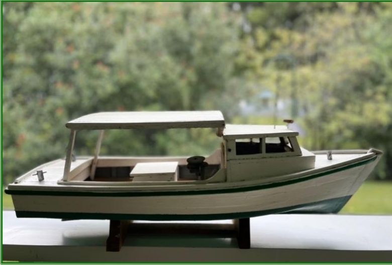
Bay Built Workboat - model built by Bob Todd