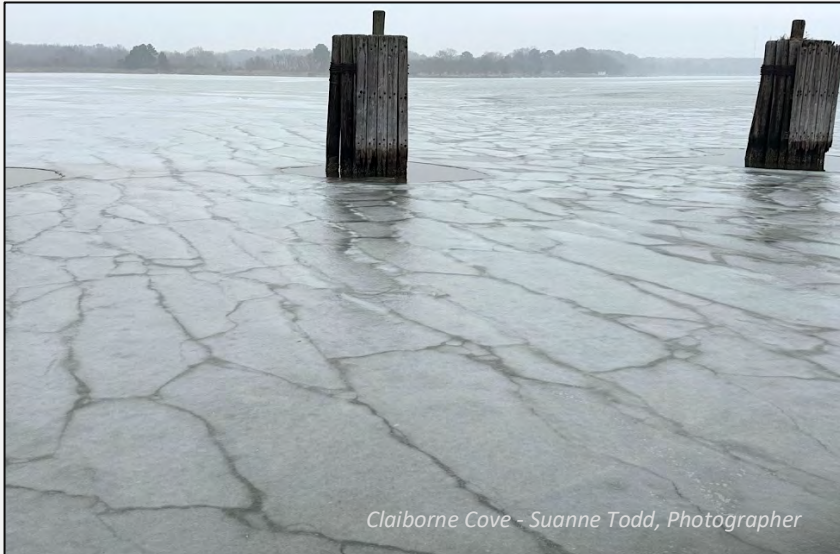
Claiborne Cove